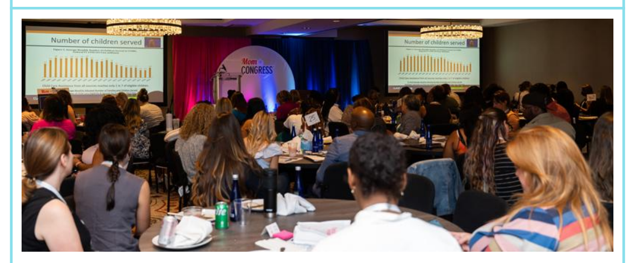
Mom Congress attendees in Mom's Agenda bill training (2022)