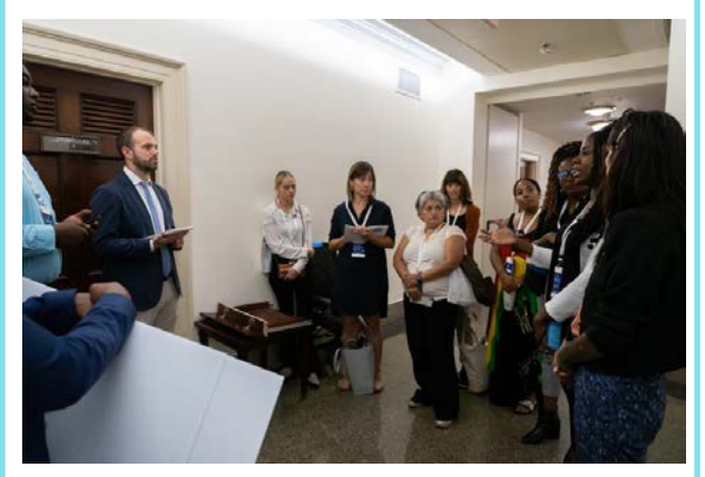
Mom Congress members taking an "in the hall" meeting with a Congressional staffer (2022)