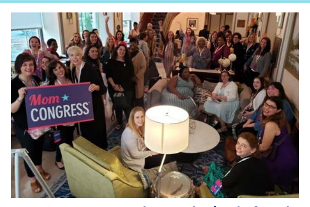
Mom Congress attendees gathering before the Convention kick-off at the opening night Soirée (2019)