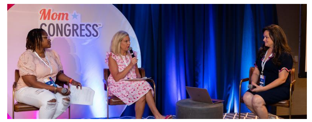
Mom Congress staff and volunteer leaders demonstrate the flow of a hill day visit.