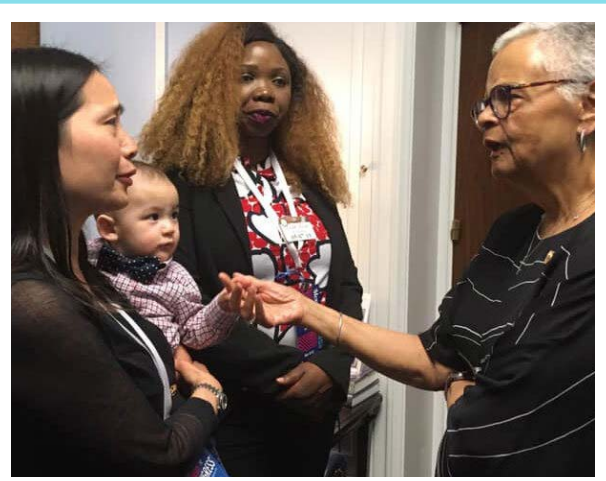
Convention attendees with members of Congress (2019)