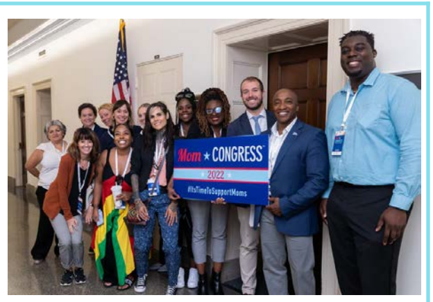
Post visit photo for members to social media (2022)