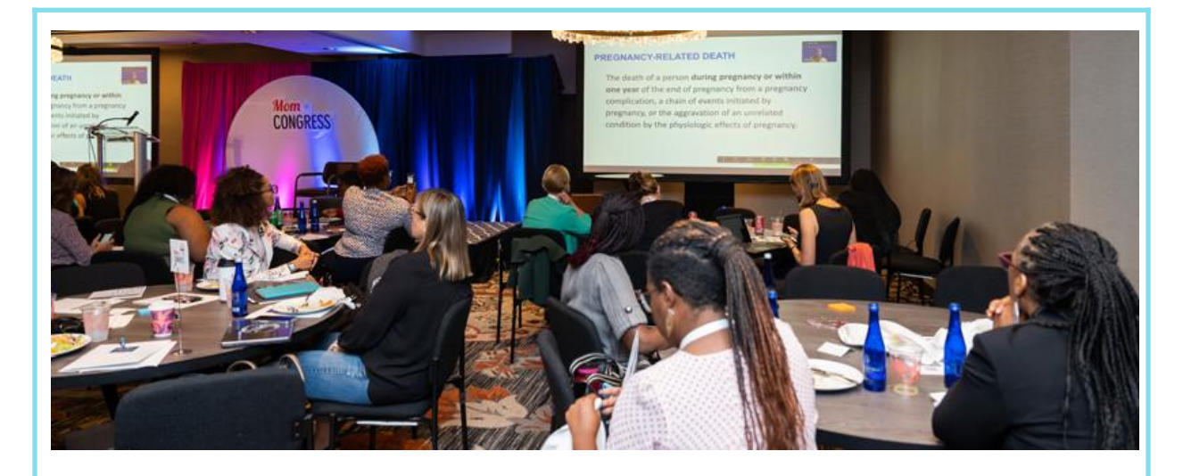
The CDC sharing the 2022 Vital Statistics maternal mortality report with Mom Congress members and members of Congress, virtually.