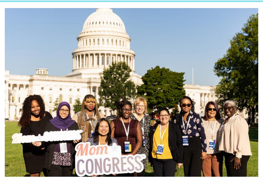
The NJ delegation prior to engaging in legislative visits (2022)